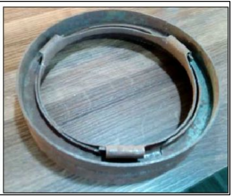
DETAIL ASSEMBLING of M and N